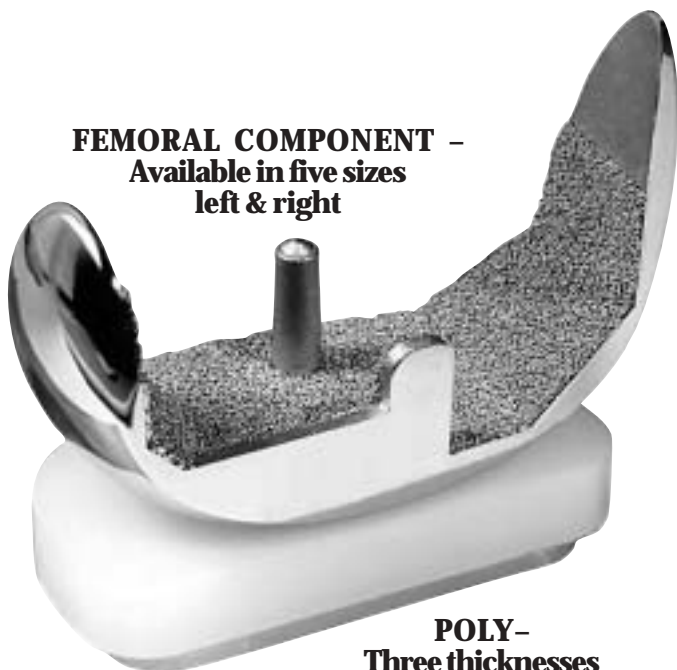
POLY– Three thicknesses per size