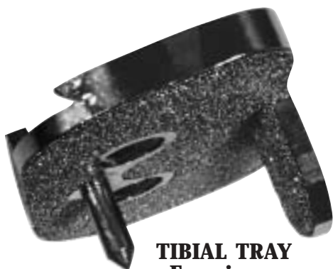
TIBIAL TRAY Four sizes