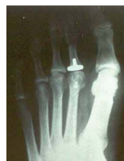
Lesser MPJ Hemi Implant